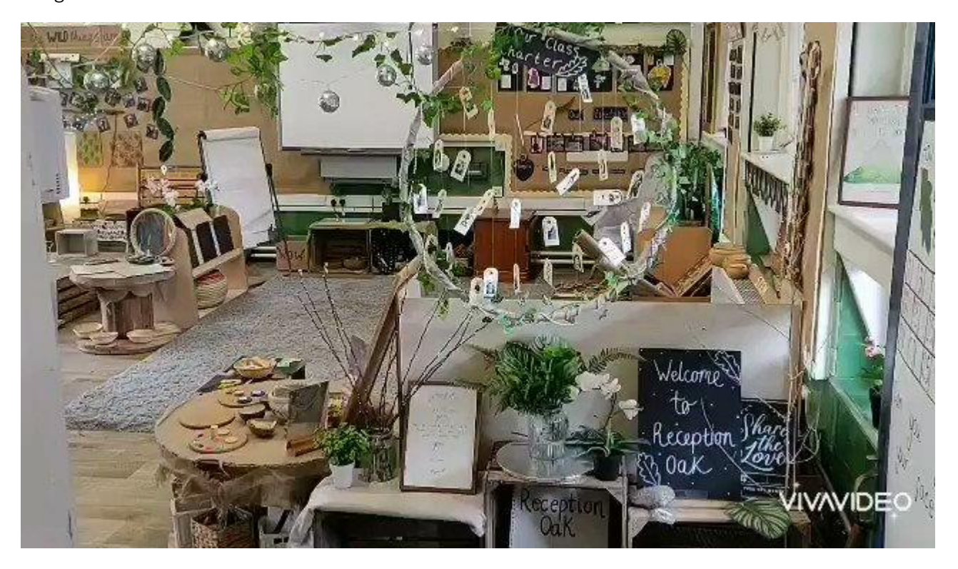
Example displays from another UL school: